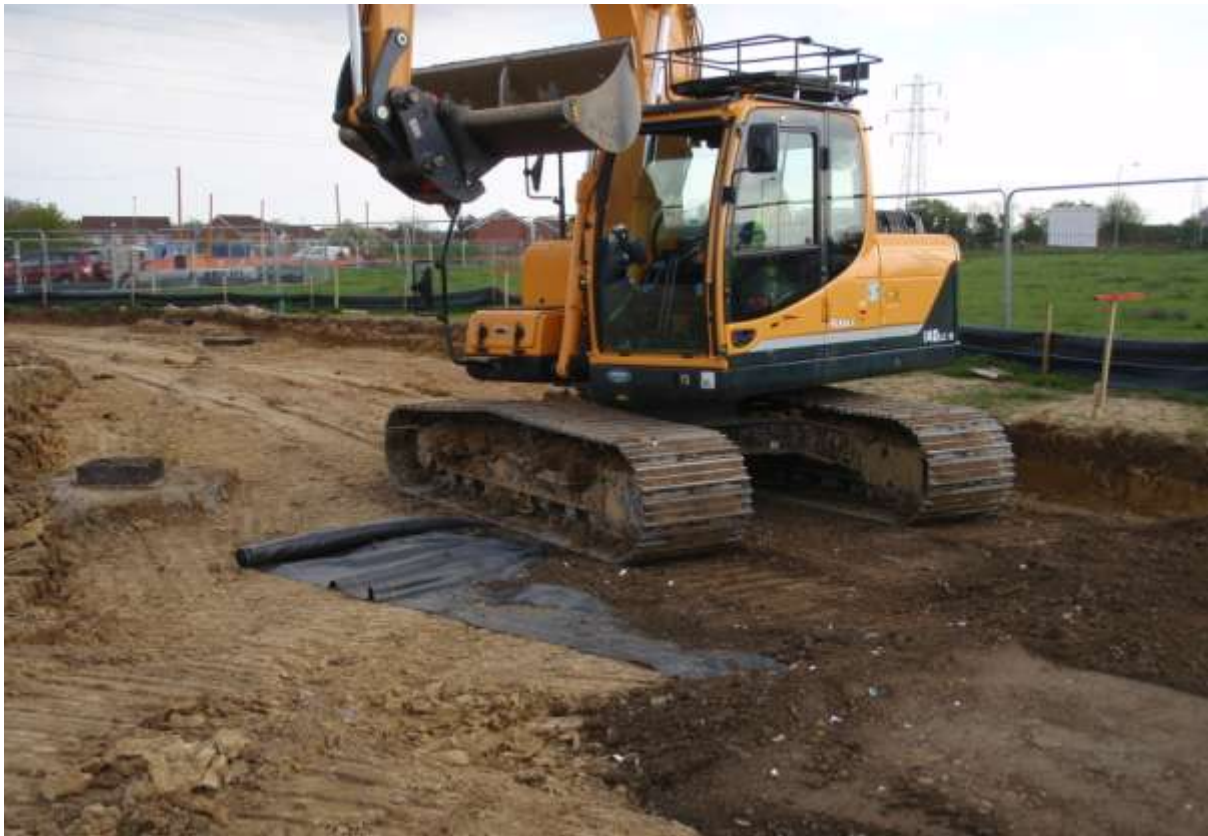
Plate 5. View of road construction (looking SW)