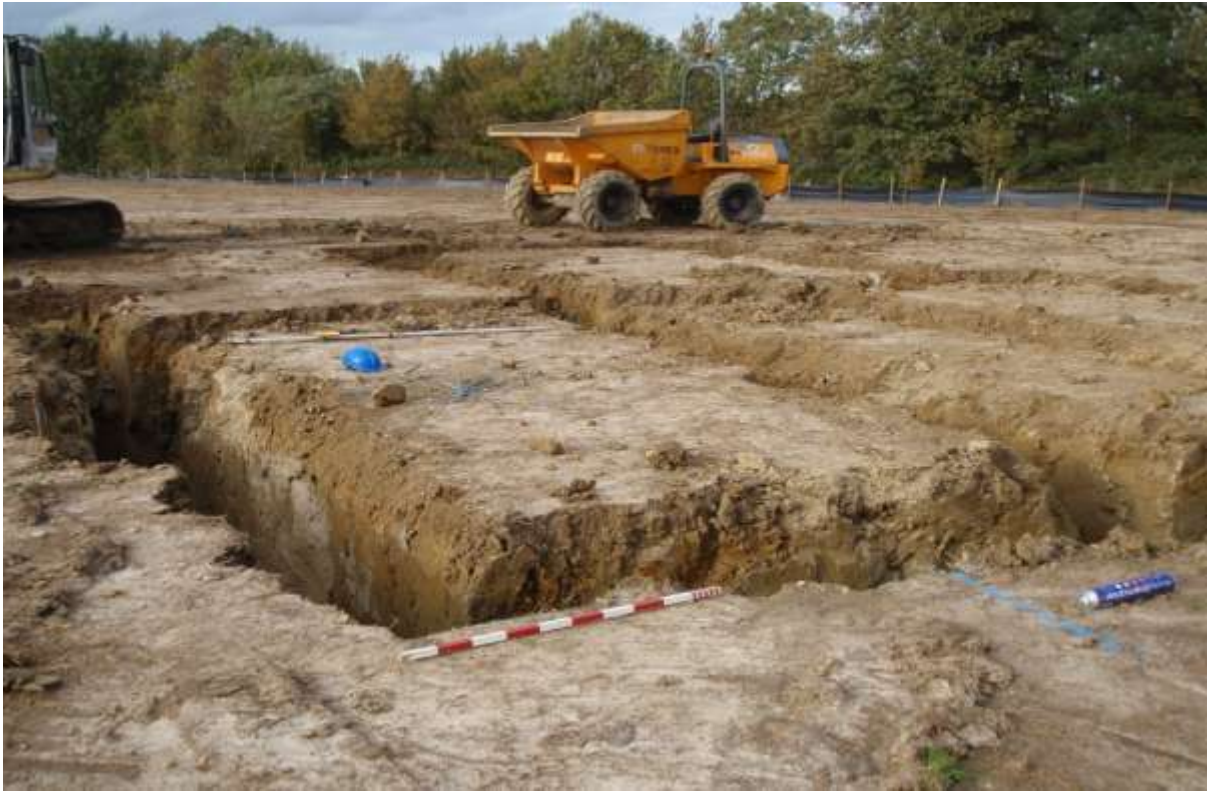
Plate 3. Ground reduction and foundation trenches (looking NE)