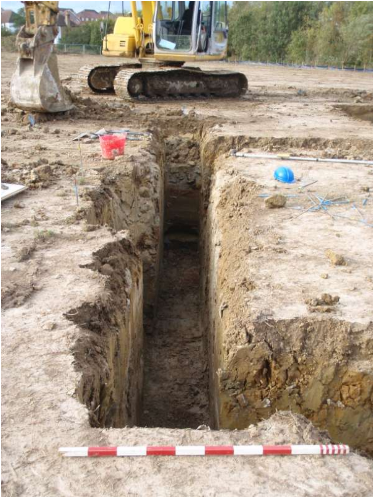
Plate 2. View of foundation trenches (looking NNE)