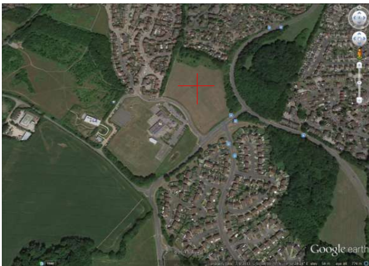
Plate 1. Aerial view showing the site prior to development.