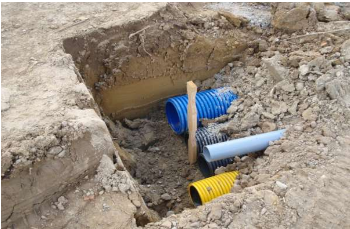
Plate 4. Service trenches