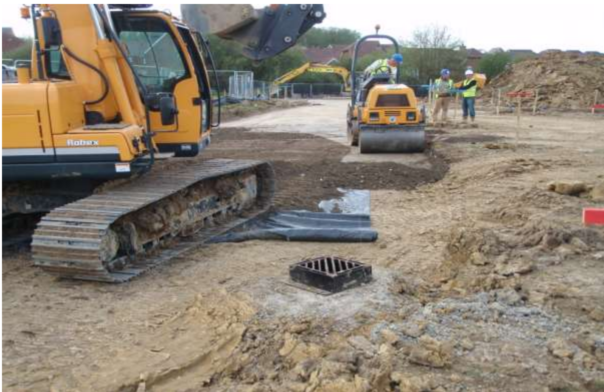
Plate 6. View of road construction (looking NE)